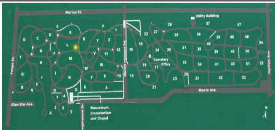
Mount Pleasant Cemetery - Yellow dot in Plot "L" is where the grave stones are found

WILLIAM S. HARGRAFT 1904 — 1966 BELOVED HUSBAND OF HARRIET M. BROUGHALL 1904 — 1978