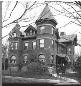
63 Queens Park Toronto, Ont.